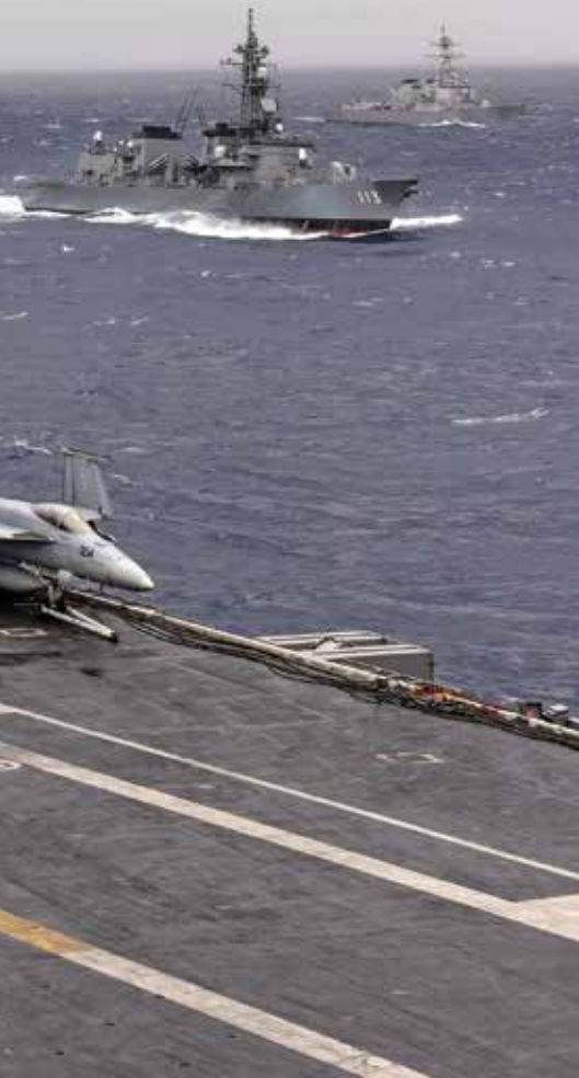
Warships from the Indian Navy, Japan Maritime Self-Defense Force (JMSDF) and the U.S. Navy sail in formation in the Bay of Bengal during exercise Malabar 2017