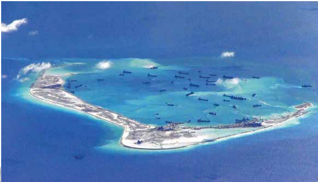
Subi Reef in the South China sea, which was built by China and transformed into an artificial island

are outside the region and may not be directly affected by any such events. Humanity is a good enough reason to drive maritime capacity and capability building initiatives. The IOR has started seeing disasters originating from the seas and causing large scale destruction of life and property. Given the socioeconomic status of the region, disaster management could be a good trigger to bring them together. The IOR needs science and technology driven infrastructure and sustained initiative that can enhance our domain knowledge that can be used across varied applications.