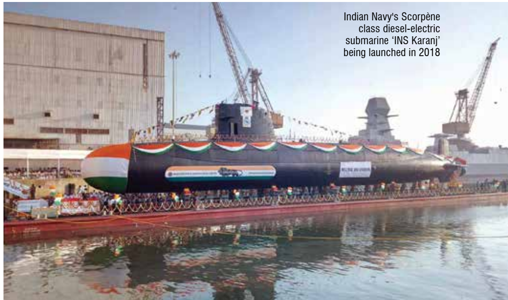
Indian Navy's Scorpène class diesel-electric submarine 'INS Karanj' being launched in 2018

Earlier in Mar 2015, the Indian Prime Minister gave a strategic vision stating "We seek a future for the Indian Ocean that lives up to the name of "SAGAR-Security and Growth for All in the Region". The SAGAR, Sagarmala, Ensuring Secure Seas: Indian Maritime Security Strategy and more are a series of strategic intent, strongly backed by policy support and tightly managed with significant maritime capacity and capability building initiatives – all this can be described as the highlights of the