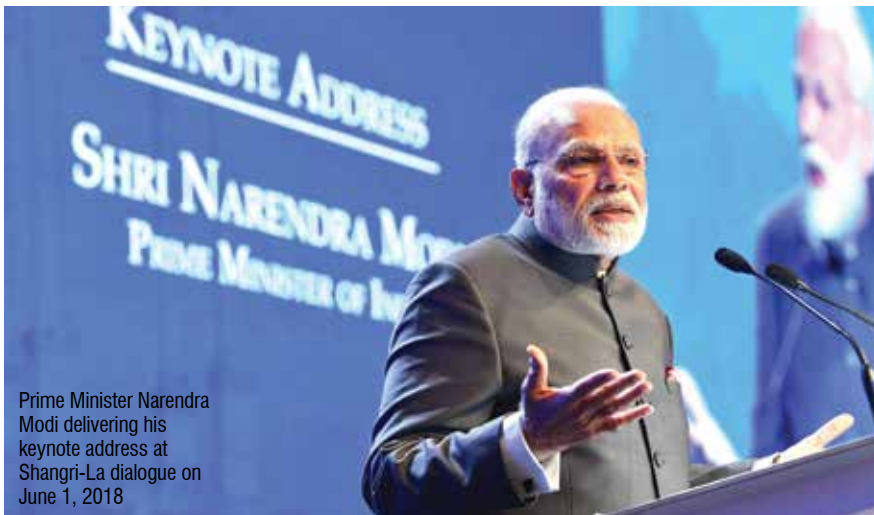
Prime Minister Narendra Modi delivering his keynote address at Shangri-La dialogue on June 1, 2018

The figure gives a comprehensive way forward for the stakeholders to engage and interact ( for reference, see figure on Page-13; Comprehensive Perspective of Undersea Domain Awareness ). The individual cubes represent specific aspects that need to be addressed. The user-academia-industry partnership can be seamlessly formulated based on the user requirement, academic inputs and the industry interface represented by the specific cube. It will enable more focused approach and well defined interactive framework. Given the appropriate impetus, the UDA framework can address multiple challenges being faced by the nation today. Meaningful engagement of young India for nation building, probably is the most critical aspect that deserves attention. Multi-disciplinary and multi-functional entities can interact and contribute to seamlessly synergise their efforts towards a larger goal.